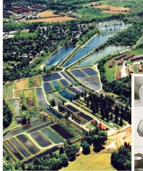
Aerial view of the main Hackettstown Hatchery.