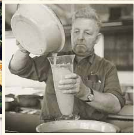
Eggs are measured prior to placement into hatching jars.