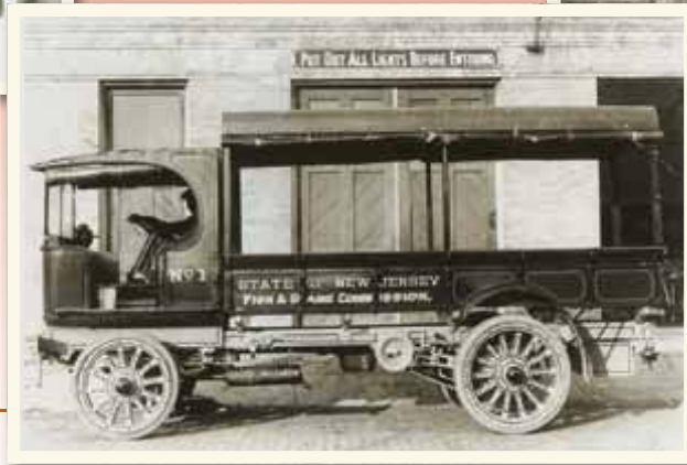
Early fish stocking truck. Trout were transported in milk cans and drums kept cool with ice.