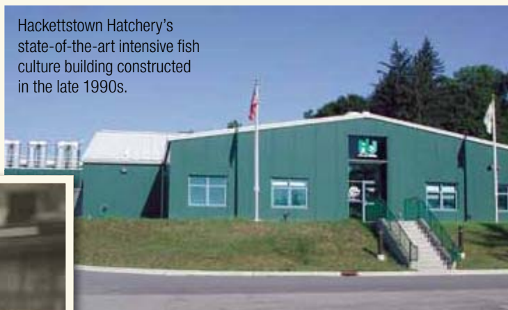
Hackettstown Hatchery's state-of-the-art intensive fish culture building constructed in the late 1990s.