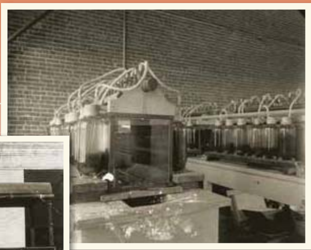
Rows of McDonald hatching jars in the original intensive fish culture building.