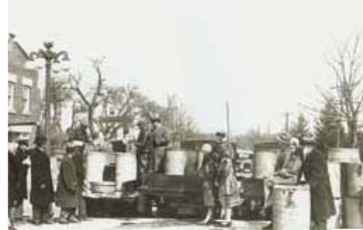
Circa 1920s opening day of trout season festivities.