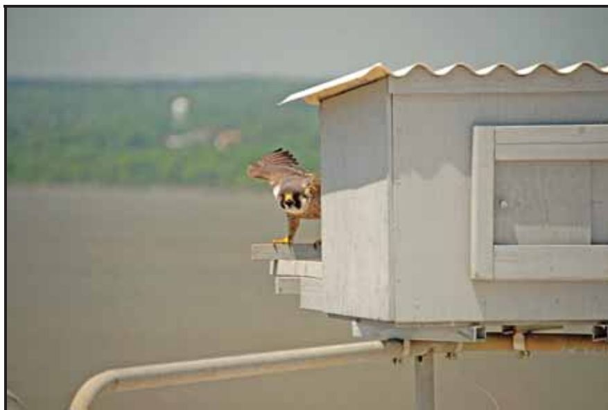
Falcon (of unknown origin) at the new nest box provided by Logan Generating Company in Gloucester County.