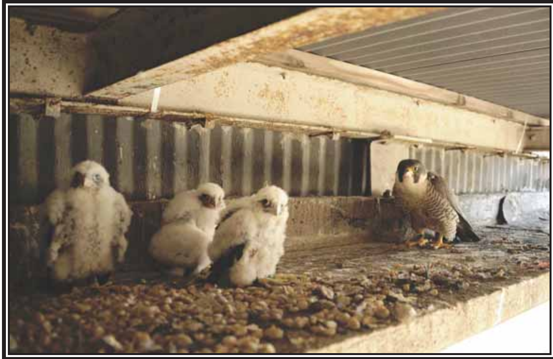
The Paulsboro nest, home to Falcon 1687-02937, banded as an adult in 2014. She died in December, 2015, but was a superbly territorial bird for nearly ten years.