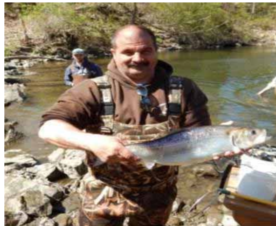
American Shad caught electrofishing below the Columbia Lake Dam

Fish and Wildlife's Bureau of Freshwater Fisheries has been monitoring sites within the Paulins Kill for two years to collect baseline data. Ten sampling locations, over 17 field days, were sampled in 2015 and 2016, involving a total of 499 man hours. These activities are funded by Hunters & Anglers and Federal Sport Fish Restoration Funds. Sampling techniques included; stream electrofishing, boat electrofishing, gill nets, trap nets, seines, cast nets and a dissolved oxygen / temperature probe. The Paulins Kill being a large, wide and deep river complicates typical sampling methods used for wadeable streams so several techniques were utilized. Below average water levels during the spring of 2015 aided sampling efforts, however 2016 water levels were closer to average making sampling more difficult.